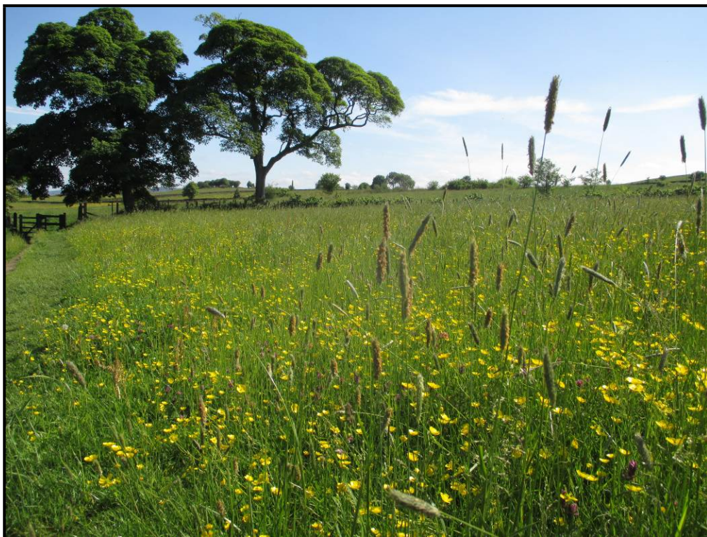
Shepley's Meadow June 2018

The Country Park was officially established in 1980 when the Hyde War Memorial Trust and Tameside MBC and the Greater Manchester Council entered into a formal agreement relating to the management of the park. Responsibilities relating to the Greater Manchester County Council were passed on to Tameside MBC in 1986 when the County Council was abolished.