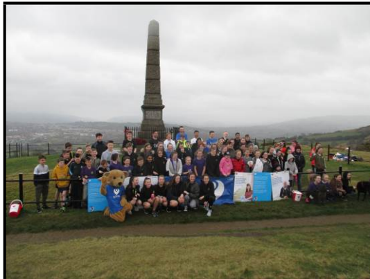
Alder Community High School run around Werneth Low for the Christie Hospital – 17 th April 2018