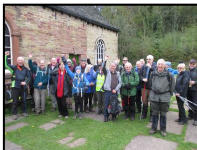
All Day Ramble to Chadkirk Chapel – April 2018