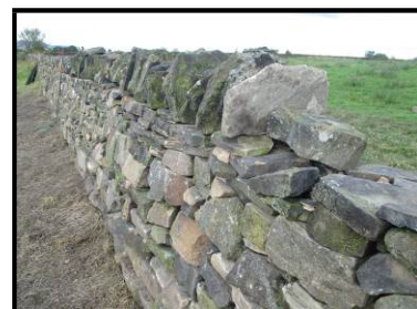
Dry Stone Walling Weekend at Rye Field Meadow September 2018