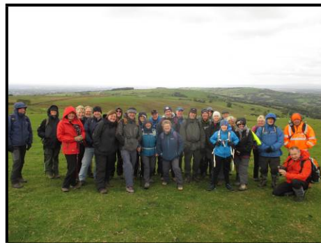
All Day Ramble Werneth Low to Cown Edge – 30 th September 2018