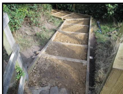
At Ash Cottage Picnic Area new steps installed June 2018

The cost of this work was paid for by Tameside Council - £13,033 .